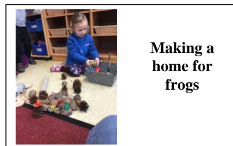
Making a home for frogs