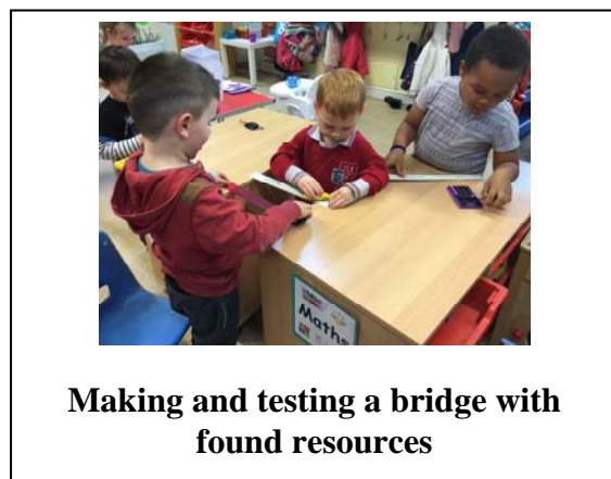
Making and testing a bridge with found resources